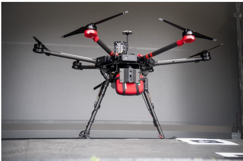
Enhanced DJI Matrice 600 Pro custom built for AED delivery operations.

Furthermore, the UAV backend system is fully integrated with the emergency call centre, enabling extremely fast and reliable dispatching routines.