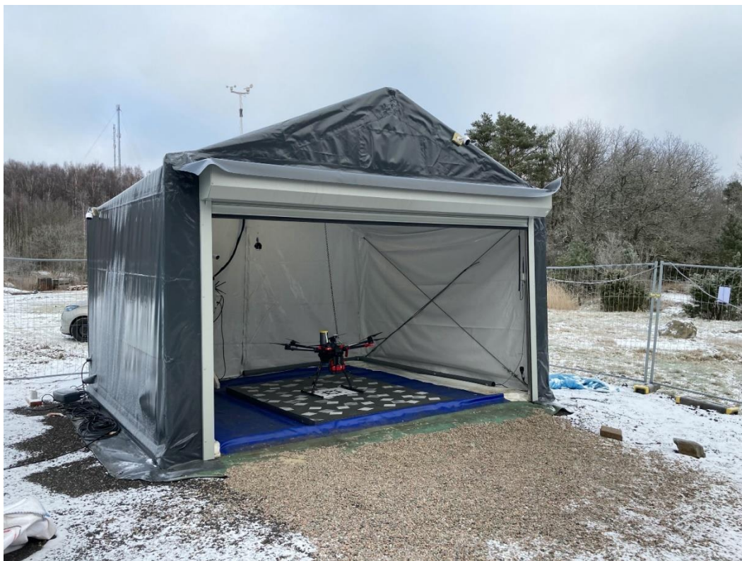
UAV on standby at home base.

The home base location is established by analysing the response time to historical OHCA incidents within the flight sector while also considering ground safety. This normally means that the hangars are placed in locations where the public usually is not present.